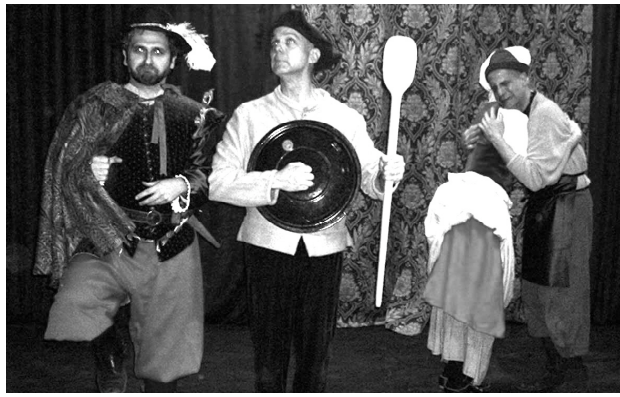
January production of scene from "Famous Victories of Henry V"